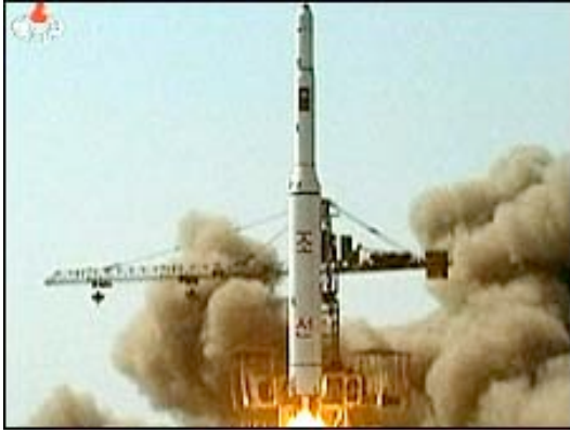
Image grab of North Korean TV showing apparent rocket launch

Pyongyang said criticism of its launch was an "unbearable insult"