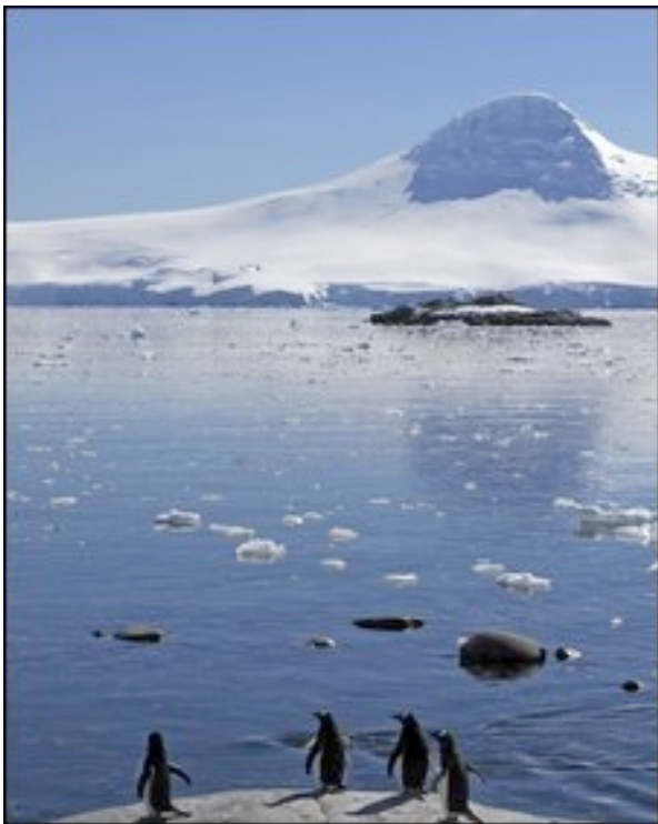
Gentoo penguins (file photo)

Less ice could spell bad news for a great many species