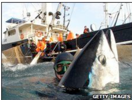
Bluefin tuna - too valuable to ignore for fishermen

The solution may be to buy canned tuna which is caught by pole and line - fishing vessels with rods and lines. This method is much less wasteful, with fewer fish dying from bycatch - and underage fish can be returned to the sea.