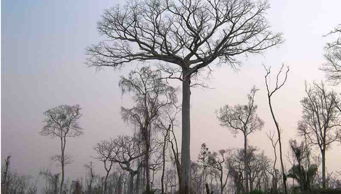
PERIL Trees like these across the Amazon are threatened by deforestation and development.

By Chris Samoray 2:50pm, November 20, 2015