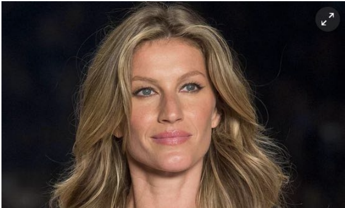
Gisele Bündchen wrote to Brazil's president: 'It's our job to protect our Mother Earth.'

Michel Temer replies to message from Brazilian supermodel to announce he will veto plans to cut conservation in the Amazon