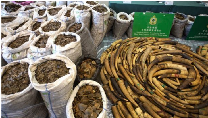
Customs officers in Hong Kong said the shipment contained 8,300kg of pangolin scales (left)

The scales of the pangolin, an endangered anteater, are said to have medicinal value in parts of Asia.