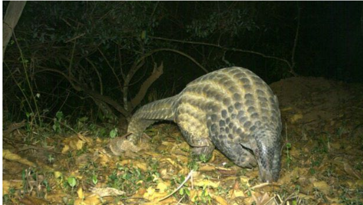
The giant pangolin: The largest of the eight species

"We know so little about this species, almost everything we're picking up on camera traps this year as a behaviour is a new thing," he told BBC News.