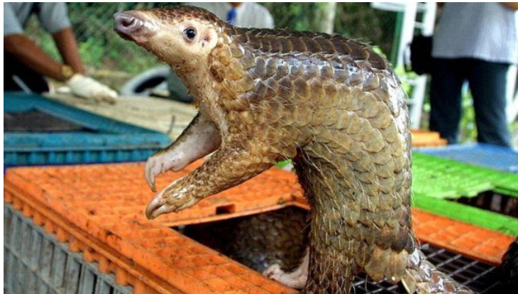
A trafficked pangolin in Kuala Lumpur: the animal is a suspect in the outbreak

By Helen Briggs BBC News 25 February 2020