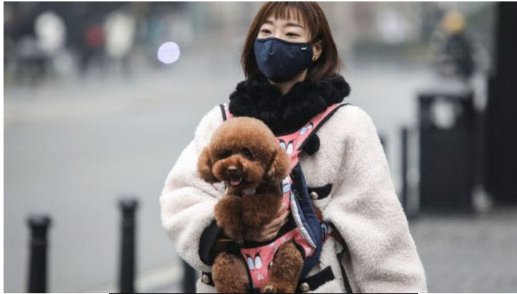
Most infections are in China but other nations are battling the virus

The second part of the puzzle, then, is the identity of the mystery animal that incubated the virus in its body and possibly ended up in the market at Wuhan. One suspect for the smoking gun is the pangolin.