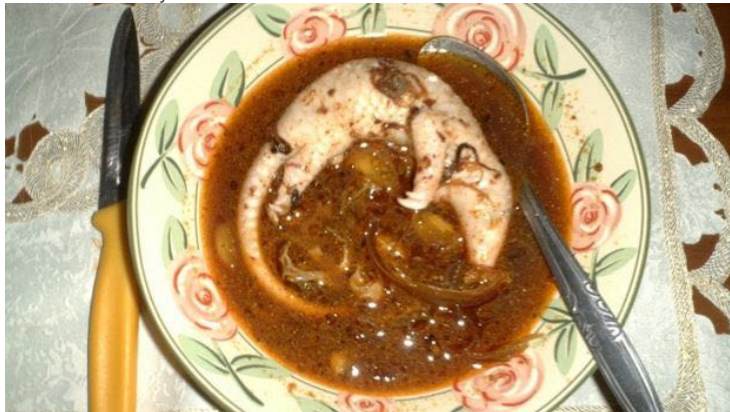
They are regarded as a delicacy in some countries

This week, authorities in Malaysia seized more than 27 tonnes of pangolins and their scales - believed to be worth at least £1.6m - on Borneo, in the biggest such haul in the country.