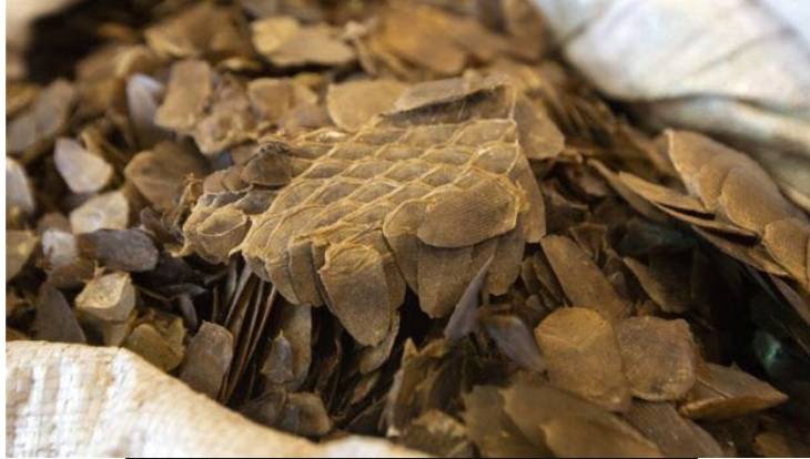
Pangolins are sought after for the unproven medicinal properties of their scales

A man and a woman from a trading company were arrested in Hong Kong, the customs department said.