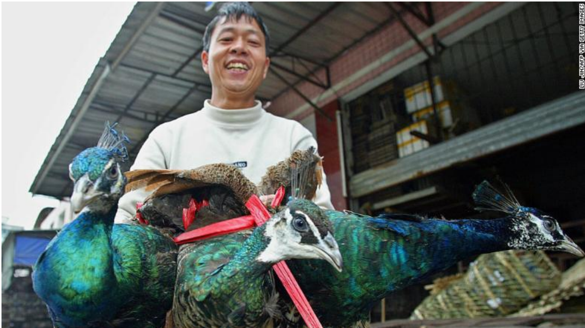
A vendor sells three peacocks at a wildlife animals market in Guangzhou, January 2004.

"I think we should listen to those voices that are calling for change and support those voices."