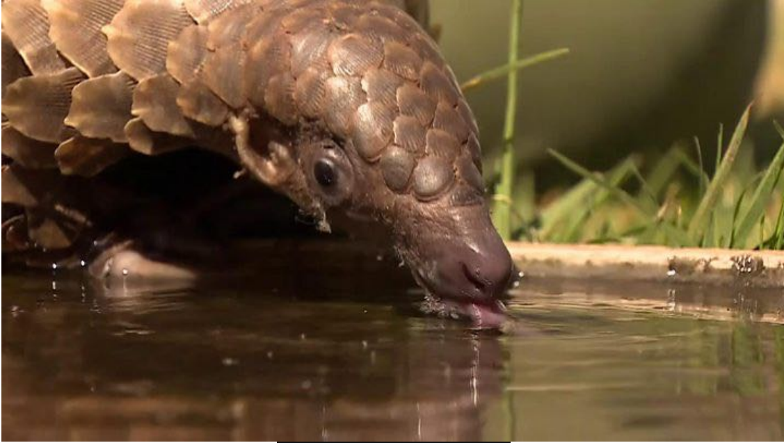
Pangolin: The most trafficked mammal in the world

A record eight tonnes of pangolin scales and more than 1,000 elephant tusks have been seized from a shipping container in Hong Kong, officials say.