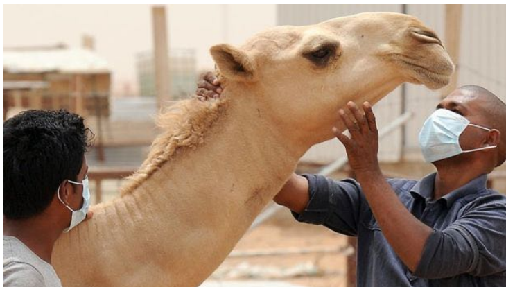
Camels can harbour the novel coronavirus, MERS

Prof Cunningham says the provenance and number of pangolins examined for the research is especially important. "For example, were there multiple animals sampled directly in the wild (in which case the results would be more meaningful), or was a single animal from a captive environment or wet market sampled (in which case conclusions about the true host of the virus could not be robustly made)?" Pangolins and other wild species, including a variety of species of bat, are often sold in wet markets, he says, providing opportunities for viruses to move from one species to another. "Wet markets, therefore, create ideal conditions for the spillover of pathogens from one species to another, including to people."