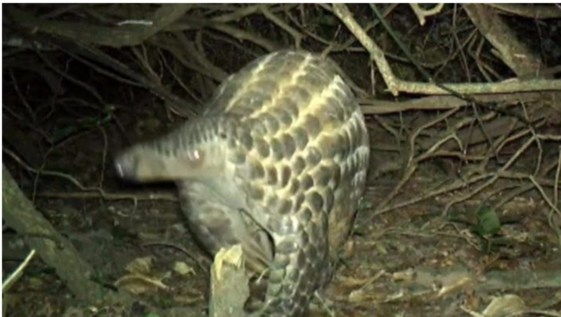
A study is being conducted by conservationists from Chester Zoo