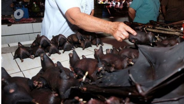
Bats being sold at an Indonesian market this month

Many of the viruses we have become familiar with in recent years have crossed over from wild animals. This is the story of Ebola, HIV, Severe Acute Respiratory Syndrome (Sars) and now coronavirus. Prof Jones says the rise in infectious disease events from wildlife might be because of our increasing ability to detect them, growing connectivity to each other, or more encroachment into wild habitats, thereby "changing landscapes and coming into contact with new viruses the human population hasn't seen before".