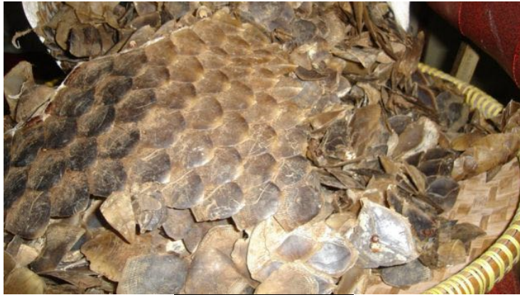
Pangolin scales intercepted on Borneo