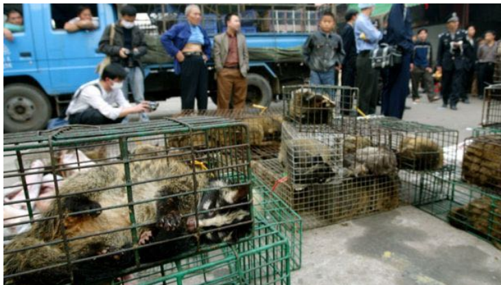
Officials seize civet cats in Xinyuan wildlife market in Guangzhou to prevent the spread of SARS

Coronaviruses have been found in pangolins, some claimed to be a close match to the novel human virus. Could the bat virus and pangolin virus have traded genetics before spreading to humans? Experts are cautious about drawing any conclusions. Full data on the pangolin study has not been released, making the information impossible to verify.