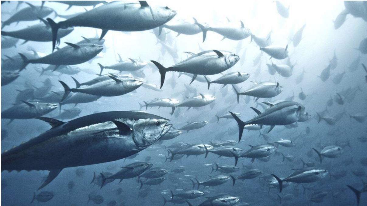
Tuna swim long distances as they migrate