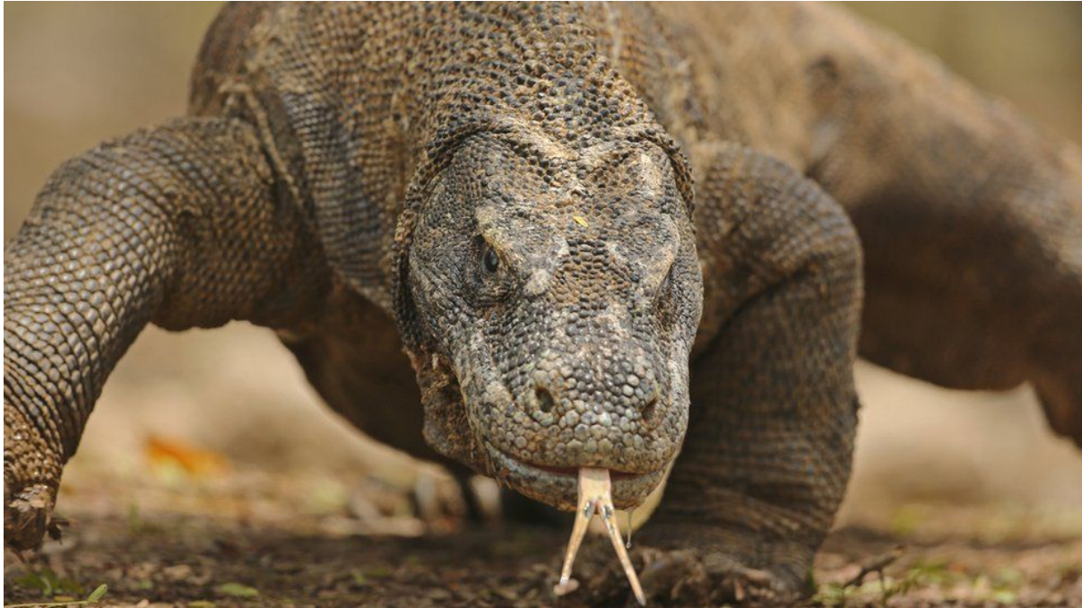
Komodo dragons are rapidly losing range in the wild

The revised list of the world's endangered plants and animals was released at the start of the world's leading conservation congress, which is taking place in the French city of Marseille from 3 to 11 September.