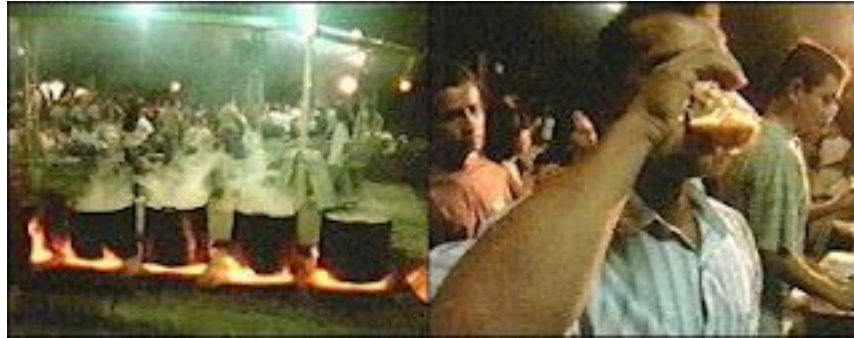
Union Vegetale ceremony

visions and their rational edifice being unraveled by the onslaught of unfamiliar and unspeakable mysteries. This is aptly why those who seek an ordered comforting world, where everything seems to make sense, even if it is a fraudulent doctrine, will place their faith in the authority of a religion where they must follow a set of prescriptive beliefs and practices and obey the instructions of the clergy.