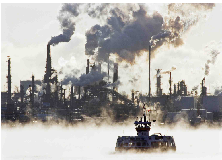
Imperial Oil's Dartmouth refinery in Hallfax, Canada. Exxon Mobil owns about 70% of the company.

The Arctic holds about one-third of the world's untapped natural gas and roughly 13% of the planet's undiscovered oil, according to the U.S. Geological Survey. More than three-quarters of Arctic deposits are offshore.