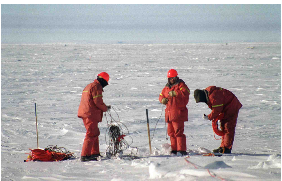
Seismic lines are used to detect natural gas and other underground deposits on the frozen Beaufort Sea.