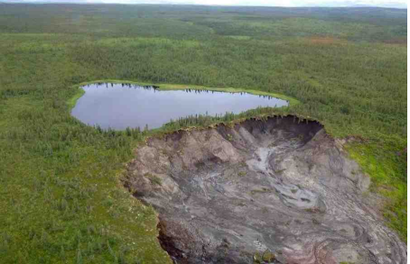
Top, the loss of sea ice due to climate change has taken a toll on wildlife. Bottom, rapidly thawing permafrost is changing the landscape in Canada's Northwest Territories.