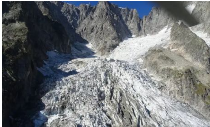
The Planpincieux glacier on the Grandes Jorasses peak of the Mont Blanc massif.

Last modified on Wed 25 Sep 2019 20:05 BST