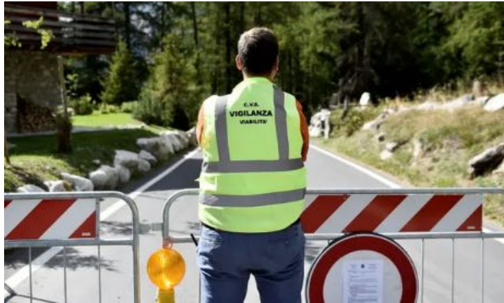
A roadblock in Courmayeur, Aosta, Italy, Photograph: Flavio Lo Scalzo/Reuters

In 2017, about 50 cubic metres of ice fell from Planpincieux, while in September last year a mass of ice broke away from the Glacier de la Charpoua, on the south-east side of the Aiguille Verte, on the French side of Mont Blanc.