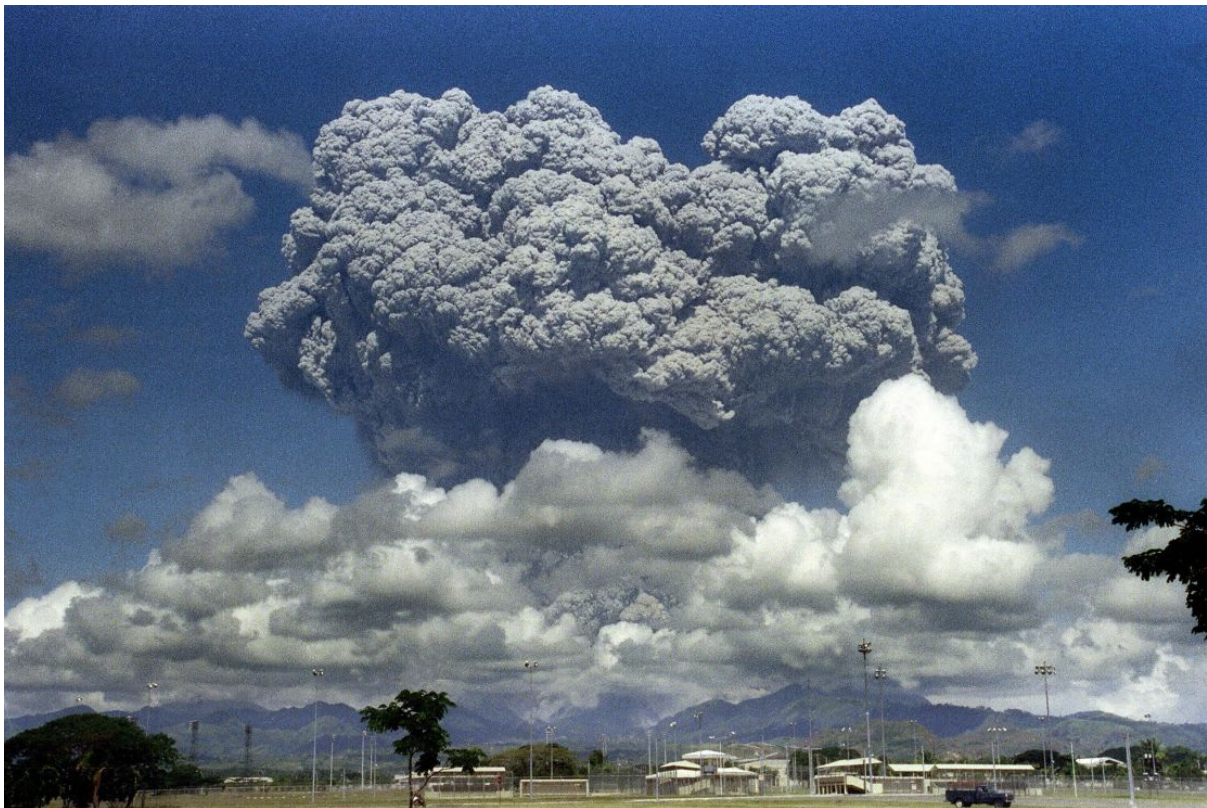
Mount Pinatubo volcano erupted in 1991, sending a cloud of ash into the atmosphere which cooled global temperatures.

While pretty much no one is claiming solar geoengineering could replace planet-warming pollution cuts and solve climate change, supporters argue it could have a big planetary cooling effect for a relatively small price tag. A 2018 Harvard study estimated it would cost around $2.25 billion a year over a 15-year period.