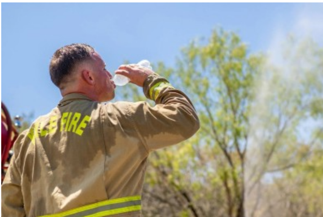
Earth just had its hottest year on record — climate change is to blame

For the past nine months, mean land and sea surface temperatures have overshoot previous records each month by up to 0.2 °C — a huge margin at the planetary scale. A general warming trend is expected because of rising greenhouse-gas emissions, but this sudden heat spike greatly exceeds predictions made by statistical climate models that rely on past observations. Many reasons for this discrepancy have been proposed but, as yet, no combination of them has been able to reconcile our theories with what has happened.