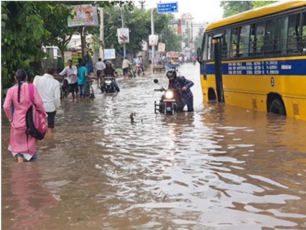
The climate disaster strikes: what the data say

So, what might have caused this heat spike?