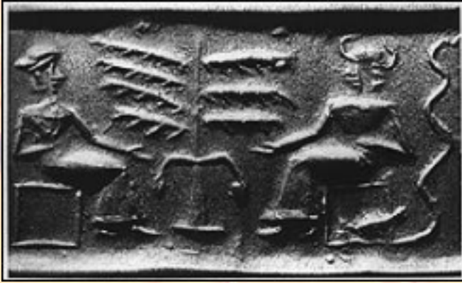
Temptation Seal: Naram-Sin (horned), and Consort ('Ningal') behold the seven-branched Tree of Life beside wise serpent Nabu. Akkadian Cylinder Seal 2330-2150 BC

tumult of emotion and bloodshed. In consummating Eden, I will spin for you a visionary prophetic tale which, far from being inconsistent with the scientific reality may prove to be a very manifestation of the creative fertility principle in space-time.